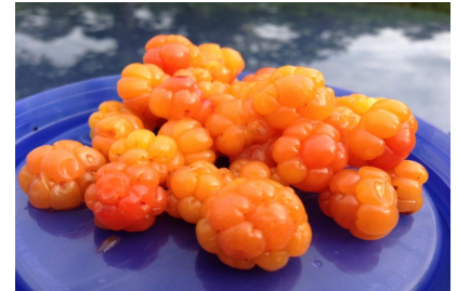
Juneau "cloudberry" (aka low-bush salmonberries)

We truly enjoy hearing from you, our customers and partners. If you have feedback regarding this newsletter or would like to offer suggestions for future articles, give us a call!